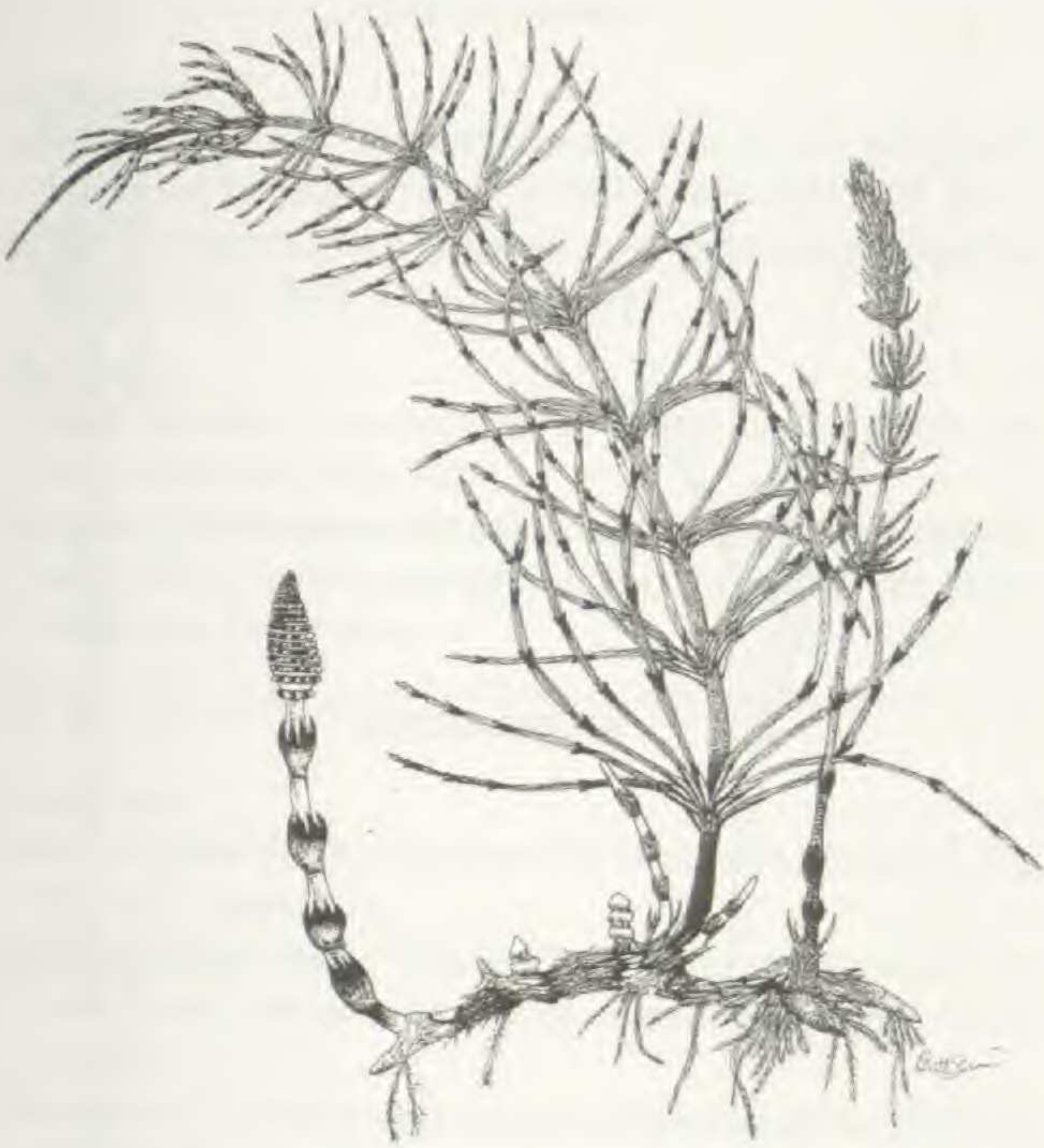
FIG. 2. Equisetum arvense .